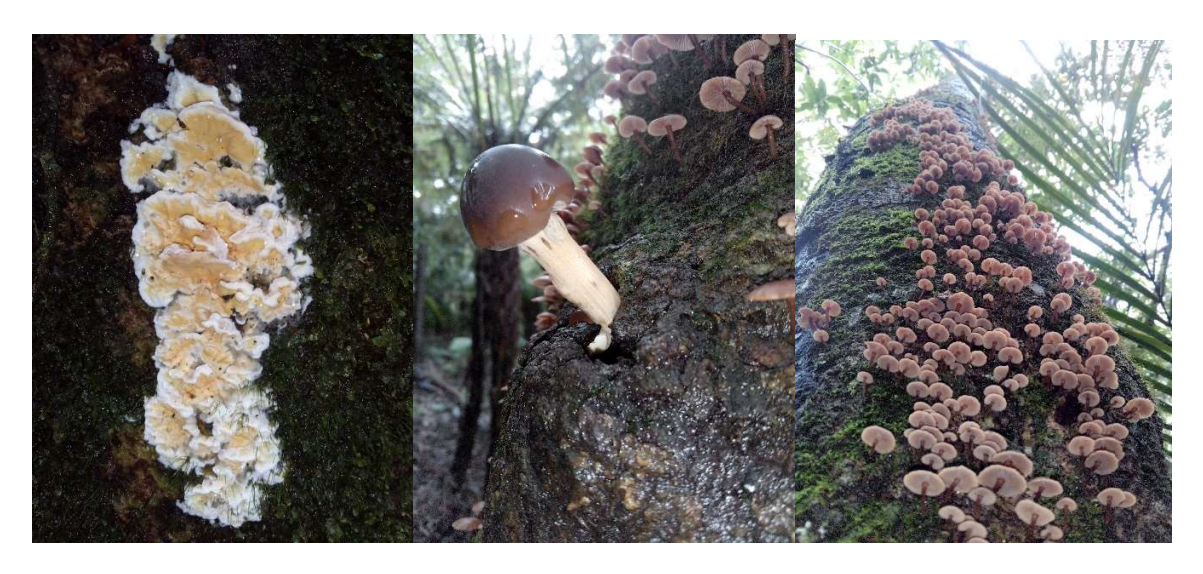
Still working on ID

April has come and gone, and the rain doesn't seem to want to stop, and the humidity turns the forest into a sauna. The forest is slippery as anything and still a bit of tree fall occurring here and there but nothing major on the main walking tracks thankfully. One good thing to come out of the wet humid climate is the fungi, the forest has erupted with all kinds of wonderful fungi species, and I can barely contain my excitement. We also found a rather large chert deposit. Chert has been used by many cultures around the world as arrow heads and cutting tools. Without further ado let's get into it.