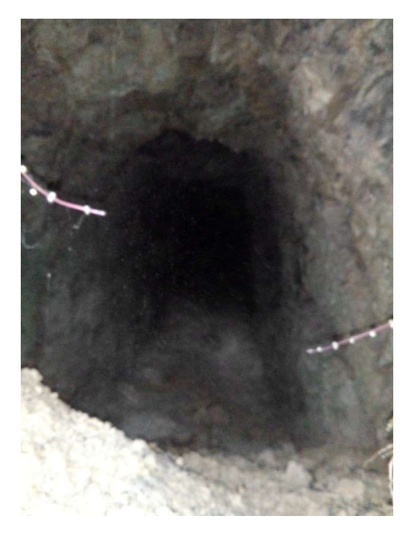
Old gold prospecting mine in Coronation reserve