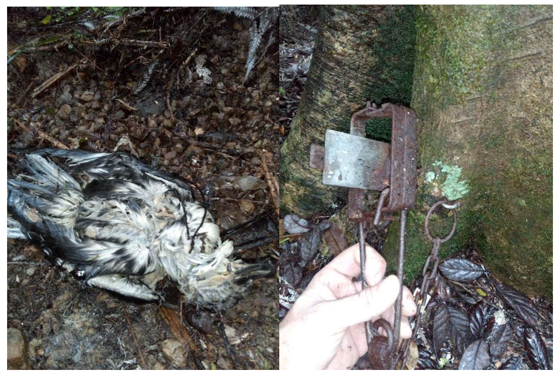
Grey faced petrel and leg hold trap in Coronation reserve.